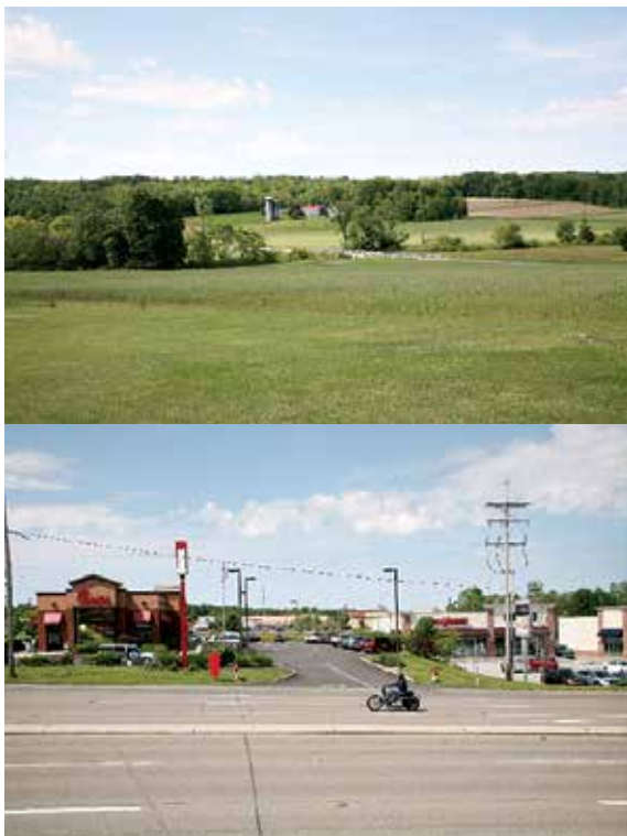
The Future Land Use Plan seeks to align the location of different uses with the goals and vision of the community.

Foremost, among the recommendations will be a series of carefully considered maps addressing needed balance between future land uses, locations of existing and planned sewer infrastructure as well as our sensitive natural resources.