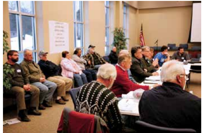
During a series of public input sessions this winter, residents, stakeholders and community officials consider issues, concerns, and policy recommendations.

This Plan seeks to build on opportunities to further excel the community's fundamental and realistic needs and abilities to address issues such as: land use relationships and related ordinance policies, economic development and vitality, community identity, public infrastructure, transportation, and storm water management.