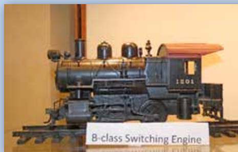
B-class Switching Engine

Please contact the Summit Township office at 868-9686 if you want to loan or donate any items.