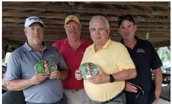
First place team in Golf Tournament