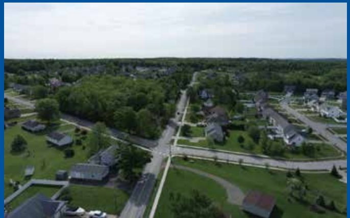
Phase 2-Hamot Road Sidewalk Project