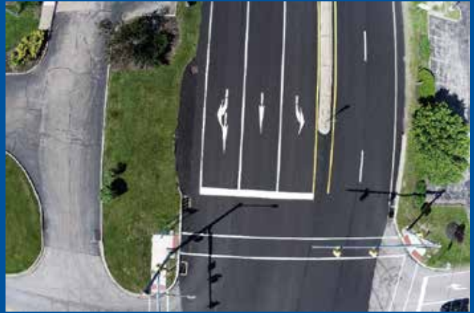
Douglas Parkway Repaving Project

We have been able to plan and identify projects a few years out. By doing this, we can get the projects designed ahead of schedule which permits us the ability to put projects out to bid in the winter thus securing a better price and getting pushed earlier into the construction season. So, we can have the summer to enjoy the finished product.