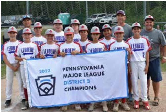
LeBoeuf Little League 12U Baseball All-Stars after District Championship Game

LeBoeuf Little League just wrapped up an extraordinarily successful season on the field. After fighting through an extremely rainy start to the season, we wrapped up the year with several placements in the All-Star Tournaments: