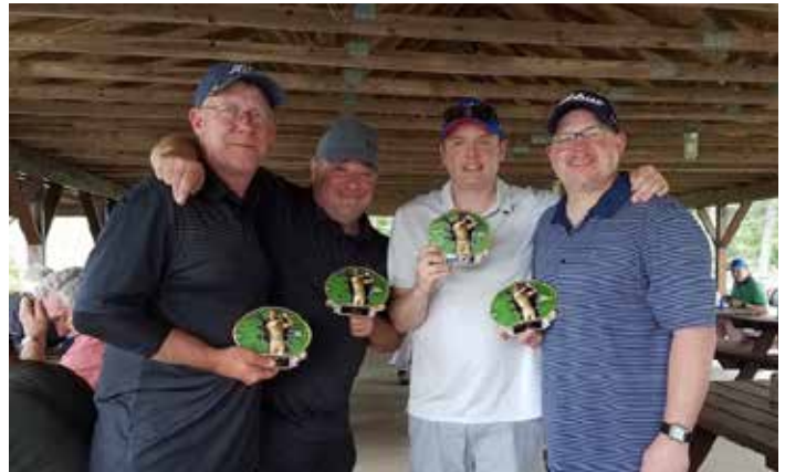
Second place team in Golf Tournament