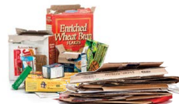
Flattened Cardboard & Paperboard Cartón y cartulina aplastados