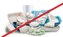
NO Foam Cups & Containers NO vasos y recipientes de poliestireno