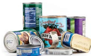
Food & Beverage Cans Latas de alimentos y bebidas