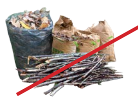
NO Green Waste NO desechos verdes