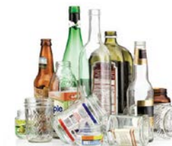
Glass Bottles & Containers Botellas y frascos de vidrio