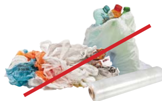
NO Loose Plastic Bags, Bagged Recyclables or Film Empty recyclables directly into your cart NO bolsas y envolturas de plástico sueltas, o materiales reciclables embolsados Vacíe directamente los materiales reciclables en nuestro carrito