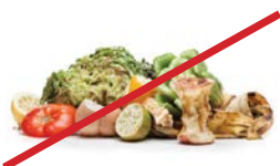
NO Food or Liquids NO comida o líquidos

DO NOT INCLUDE IN YOUR MIXED RECYCLING CONTAINER / NO INCLUIR EN SU CONTENEDOR DE RECICLAJE MIXTO