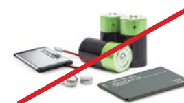
NO Batteries – check local drop-off programs for proper disposal NO baterías - Verifique los programas locales de entrega para su correcta eliminación

To Learn More Visit: Para más información, visite: wm.com/recycleright