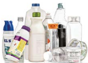
Plastic Bottles & Containers Botellas y envases de plástico