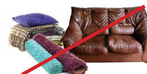
NO Clothing, Furniture & Carpet NO ropa, muebles y alfombras